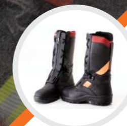
CHARNAUD® FIRE-SAFE® Structural Fire-fighting Boots. Sizes: UK 5 - 12 EN 15090: 2012 & CE certified