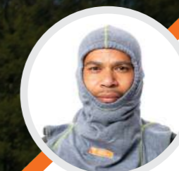
CHARNAUD® FIRE-SAFE® Fire-fighting Balaclava, highly moisture absorbent. One Size fits all EN 531:1995 A, B2, C1 and E1