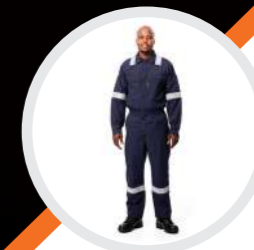
CHARNAUD® FIRE-SAFE® One Piece Coverall Colour: Navy. Optional: 50mm Lime and Silver or Silver reflective tape around biceps and legs, above the knee. Sizes: 77cm - 152cm