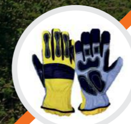
CHARNAUD® FIRE-SAFE® Extrication / Rescue Gloves Sizes 8 - 10 EN 420: 2003 +A1: 2009; EN 388: 2016 (4131)