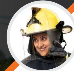
CAIRNS 360 Structural Fire-fighting Helmet.