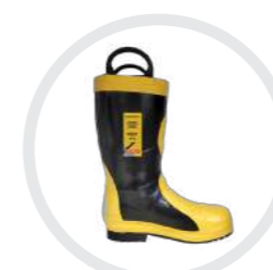
FIRE-SAFE® FLAME RESISTANT Flame Resistant, Steel Toe and Midsole Sizes: UK 4 - 12 EN15090: 2012 ISO9001: 2008 CCC GA6-2004