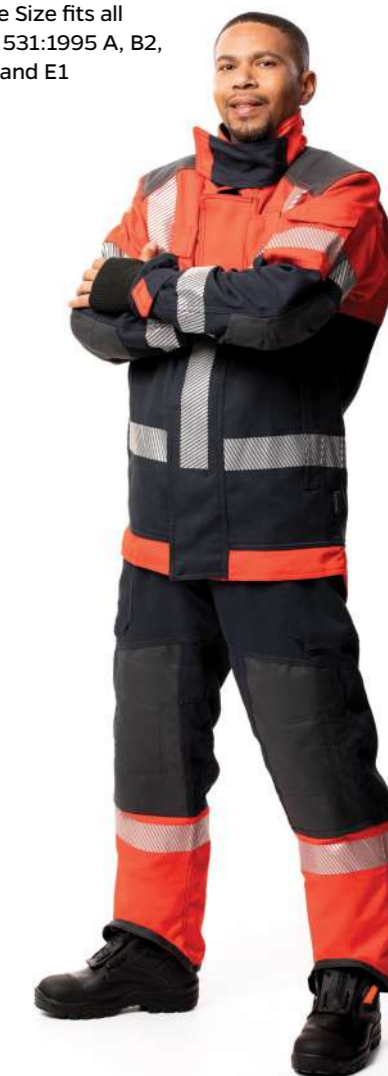
CHARNAUD® FIRE-SAFE® RESCUE-LITE Jacket and Trousers 50mm Silver segment reflective tape with zip front and Velcro® closure. Standards: Outer shell: SANS 50469 (EN 469). Thermal liner and moisture barrier: EN ISO 11612. EN 373. EN 20811. ASTM F1671. Garment: SANS 50469 (EN 469).