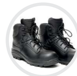
CHARNAUD® FIRE-SAFE® E20300 Safety Boots. Full leather, safety half boot with laces. EN ISO 20345:2011. CE Certified. Outsole: Electrical shock resistance up to 20kV (dry conditions) (test method - ASTM F2412-05:2005 mod).