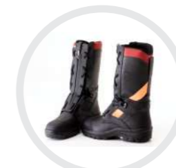
CHARNAUD® FIRE-SAFE® Structural Fire-fighting Boots. Sizes: UK 5 - 12 EN 15090: 2012 & CE certified