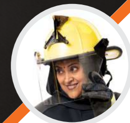
CAIRNS 360 Structural Fire-fighting Helmet.