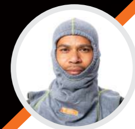
CHARNAUD® FIRE-SAFE® Fire-fighting Balaclava, highly moisture absorbent. One Size fits all EN 531:1995 A, B2, C1 and E1

Our garments meet the requirements of: NFPA 70E; ASTM F1506; NFPA 1977; NFPA 2112; OSHA 1910.269; EN 340; EN ISO: 11612; IEC 61482-1-1; OEKO TEX STD 100 and ASTM F1959.