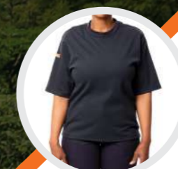
CHARNAUD® FIRE-SAFE® FR Short Sleeve T-shirt. Sizes: S - 5XL