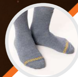
CHARNAUD® FIRE-SAFE® FR Thermal Socks, highly moisture absorbent and anti-bacterial. On Size fits all EN 531; EN ISO 14116 and CE certified.