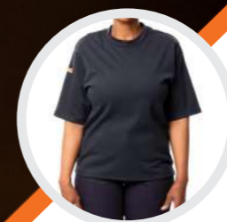
CHARNAUD® FIRE-SAFE® FR Short Sleeve T-shirt. Sizes: S - 5XL