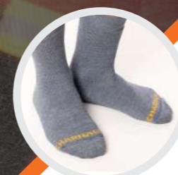
CHARNAUD® FIRE-SAFE® FR Thermal Socks, highly moisture absorbent and anti-bacterial. On Size fits all EN 531; EN ISO 14116 and CE certified.