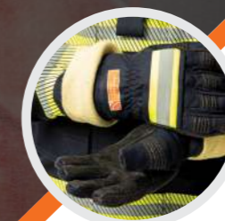
CHARNAUD® FIRE-SAFE® Structural Fire-fighting Gloves. Sizes: S - 2XL EN 659:2003+A1:2008; EN 388: 2016.