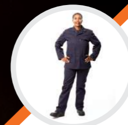
CHARNAUD® FIRE-SAFE® Two Piece Conti Jacket and Trousers. Colour: Navy Optional: 50mm Lime and Silver or Silver reflective tape around biceps and legs, above knees. Sizes: 72cm - 132cm