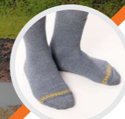
CHARNAUD® FIRE-SAFE® FR Thermal Socks, highly moisture absorbent and anti-bacterial. One size fits all EN 531; EN ISO 14116 and CE certified.