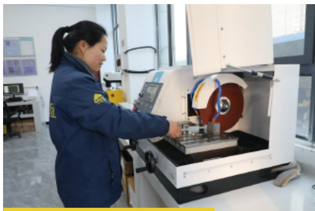
METALLOGRAPHIC SPECIMEN 金相检测