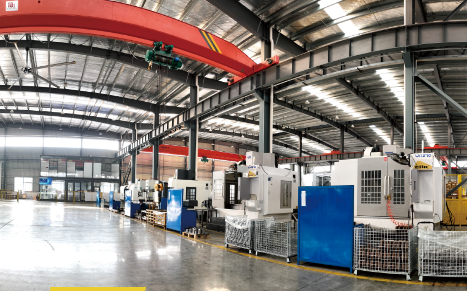
MACHINING EQUIPMENS 机加工设备