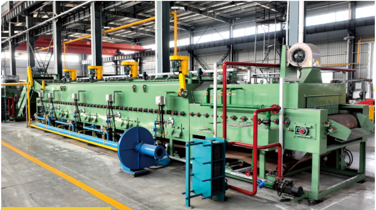
MESH CONVEYING FURNACE 网带炉连续线