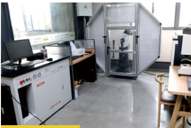
IMPACT TESTING 冲击测试