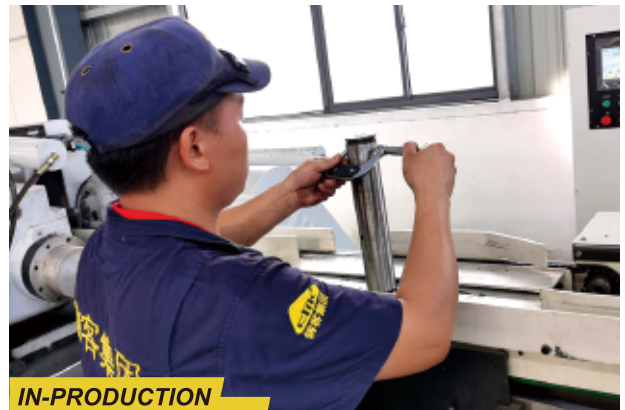
IN-PRODUCTION QUALITY CHECKING 生产过程质检