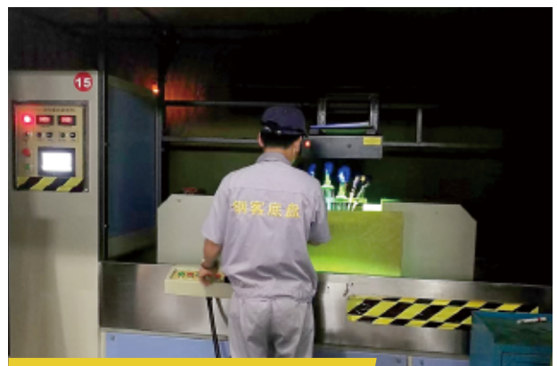
MAGNETIC PARTICAL TESTING 磁粉探伤