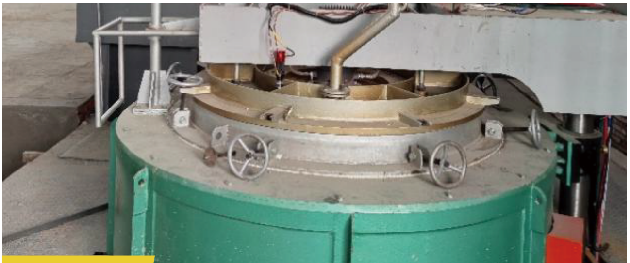
CARBURIZING FURNACE 渗碳炉